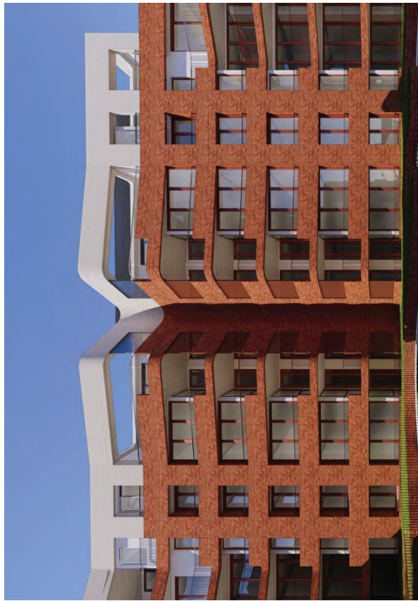
View from Oasis looking East