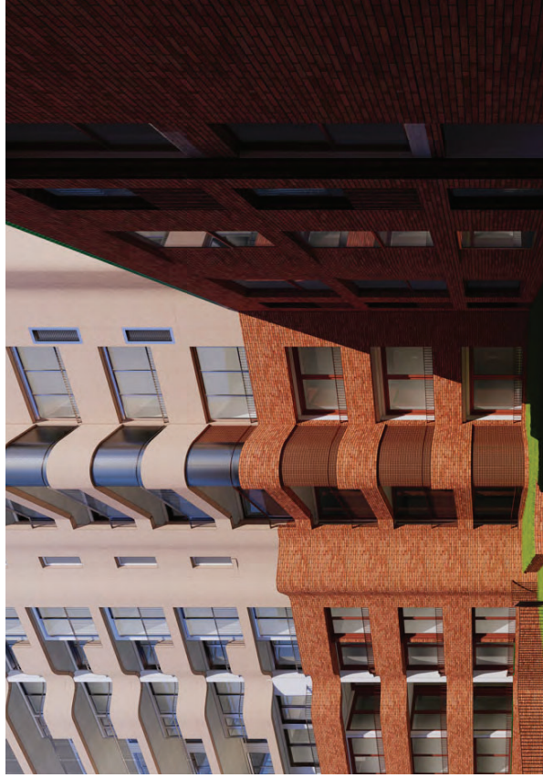
View from Oasis looking West