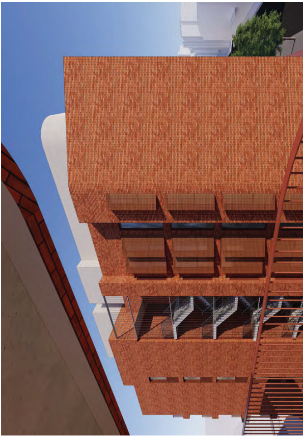
View from D2(b) to D2(a) looking North